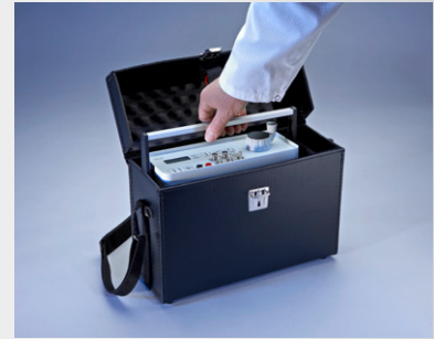
Carrying bag KAL 84 Order no. 9062.0001