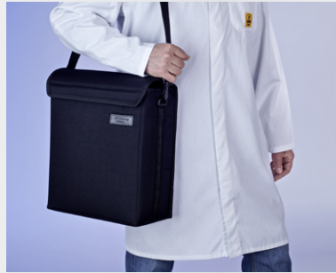
Carrying bag KAL 100/200 supplied as standard