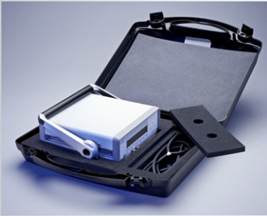
Transport case KAL 100/200 Order no. 9220.0002