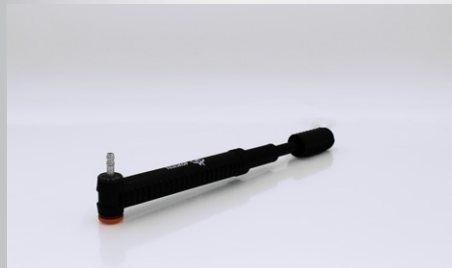
Hand pump KAL 84 Order no. 9601.0036