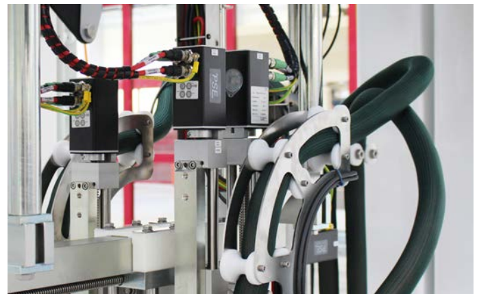
Fig. 2: Schubert uses positioning systems from halstrup-walcher GmbH for format adjustment.

Schubert’s machines are principally used for packaging individual products in trays or folding boxes before dispatch. “Our range includes a box erector, grouping, loading and closing machines and a palletizer,” explains Bögelein.