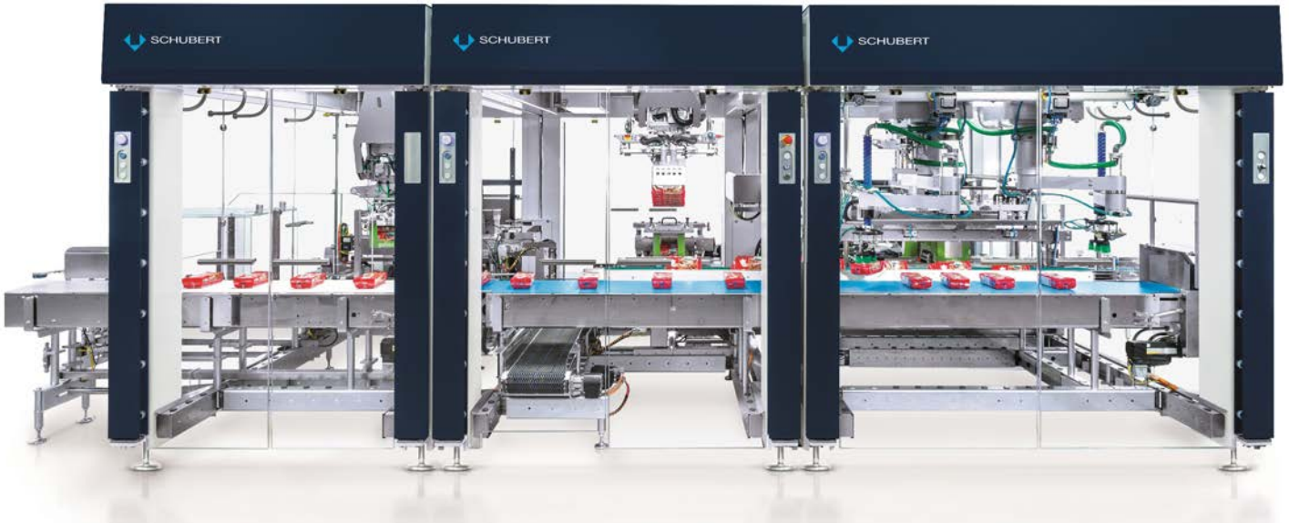
Fig. 1: Gerhard Schubert GmbH wants to guarantee a consistently high level of packaging quality and one of the best ways to achieve this is through standardisation of workflows in machines.

Fast and flexible format changeovers are vital for maximising the efficiency of automated packaging lines. Gerhard Schubert GmbH is a market leader in top-loading packaging machines (TLM) and therefore decided to invest in positioning systems (PSE) from halstrup-walcher GmbH to switch between package formats. Positioning systems use intelligent control system technologies to adjust the various axles of a machine to the packaging format specified for the product. This saves time, reduces the number of rejects, prevents machinery standstills caused by incorrect settings and thus ensures high quality standards.