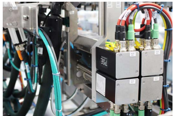
Fig. 5: Automatic adjustment of the glue application module for gluing boxes: It is vital to apply exactly the right amount of adhesive in exactly the right place.

Hand wheels have now been replaced by actuators which adjust the machine axles automatically. Yet these too have disadvantages. Although they are able to move independently to a specified target position, they can be interrupted or prevented from doing so by an obstruction. The operator would be unaware of the problem because the actuator has no way of reporting its position. "But positioning systems from halstrup-walcher know exactly where they are – and enable the operator to view their position at any time via the machine control unit," explains Bögelein. "Actuators without smart technology cannot do this." In other words, halstrup-walcher's intelligent positioning systems move to their specified target positions, monitor their own position and report this information